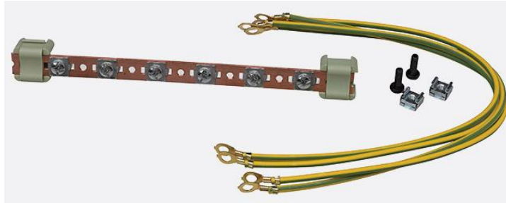
12-7010 CANFORD EARTH KIT 6 earth points, 4 x 4mm diameter 40cm wires

Universal rack earth kits providing a central point for equipment earth connections.