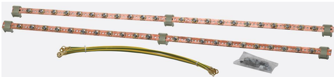
12-7013 CANFORD EARTH KIT Vertical, 2 x 78cm 22 point copper bars, 4 x 4mm diameter 40cm wires